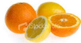
Protecting the skin against oxidative stress

contain a healthy portion of vitamin B - which is important for blood formation and the metabolism - plus valuable minerals such as potassium and calcium. Potassium lowers the blood sugar level and promotes cell growth. Calcium ensures strong bones, healthy teeth and taut skin. The flavonoid content is also an